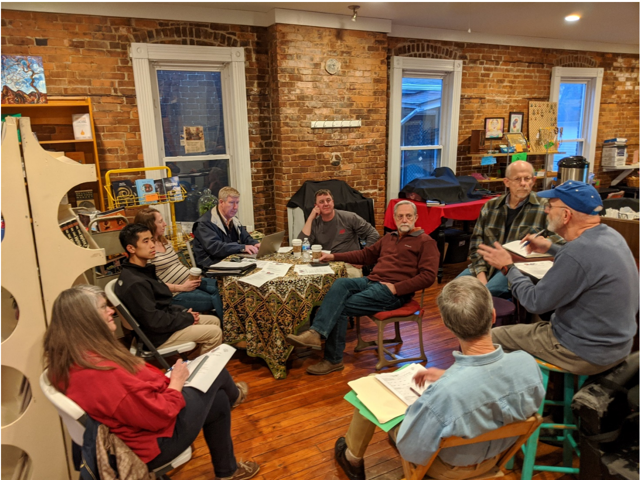
Figure 1: Executive board business meeting in the Wild Fig on February 18