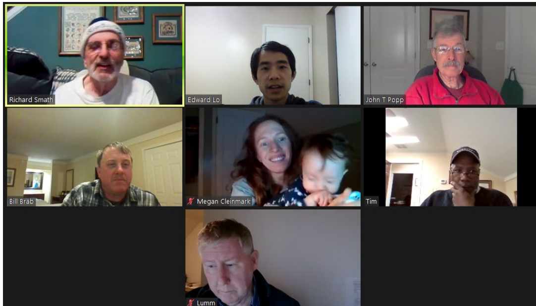
Figure 2: screen capture of Executive Board Zoom meeting on November 30, 2020. The section conducted all business meetings remotely starting in March 2020, and the meeting link was emailed to all members.