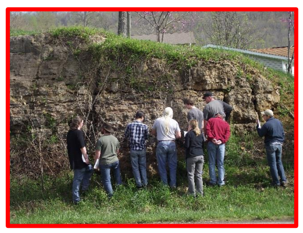
Examination in the field.