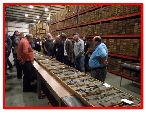
Hands-on core presentation.