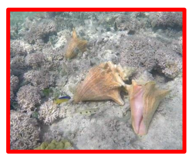
Plenty of snorkeling opportunities.