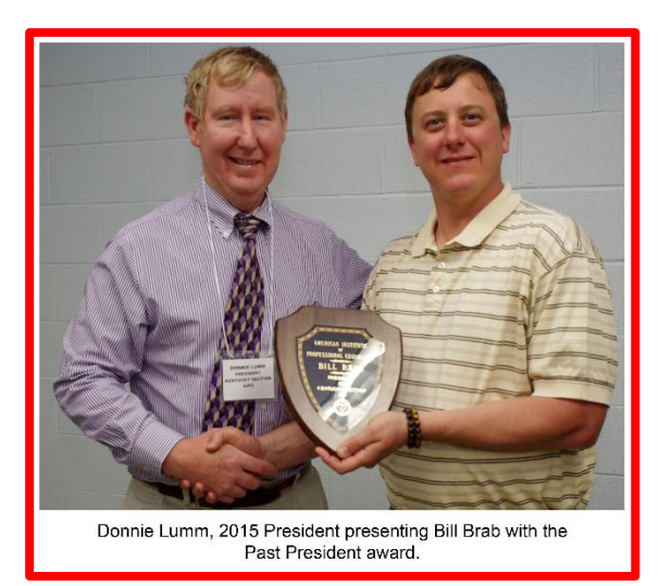
KY-AIPG SUMMER 2015